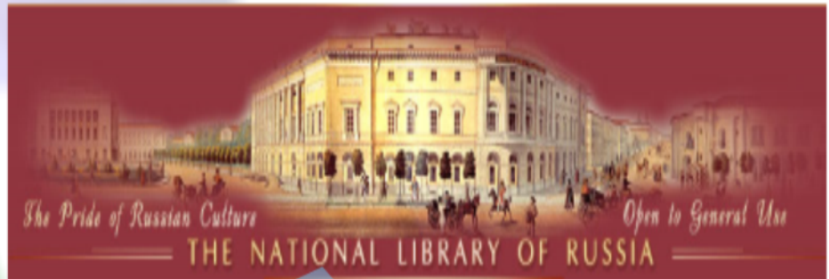
St. Petersburg Library is supposed to be the largest in the world.