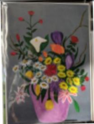
also an acrylic painting

Saturday, 2/27 and 3/3: Art with Rhea 10am-11:30