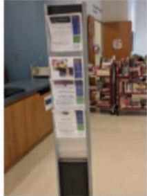
Pamphlets & Class Info